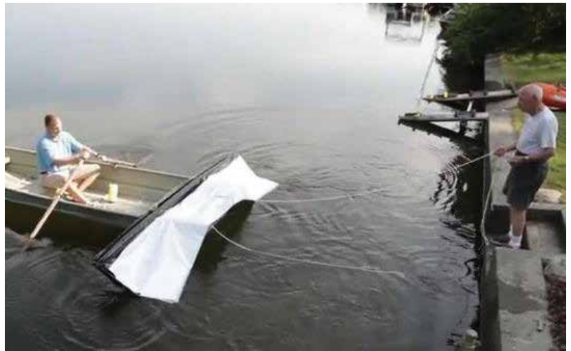
Installing a benthic barrier