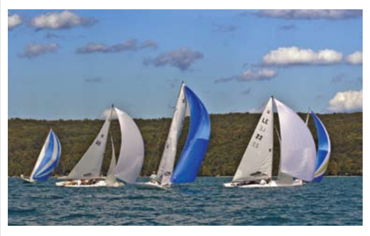
E Scows competing on Torch Lake