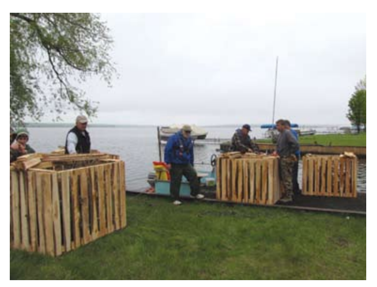
Fish shelters ready for positioning, Hubbard Lake Association

We have questions about the effectiveness of this hand digging and suction removal technique for removing E. milfoil from Torch Lake. Our plan, at this point in time, is to comprehensively survey the two sites next summer and then re-evaluate the pros and cons of the options for effectively removing E. milfoil from Torch Lake.