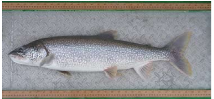
Possible relict lake trout from Elk Lake