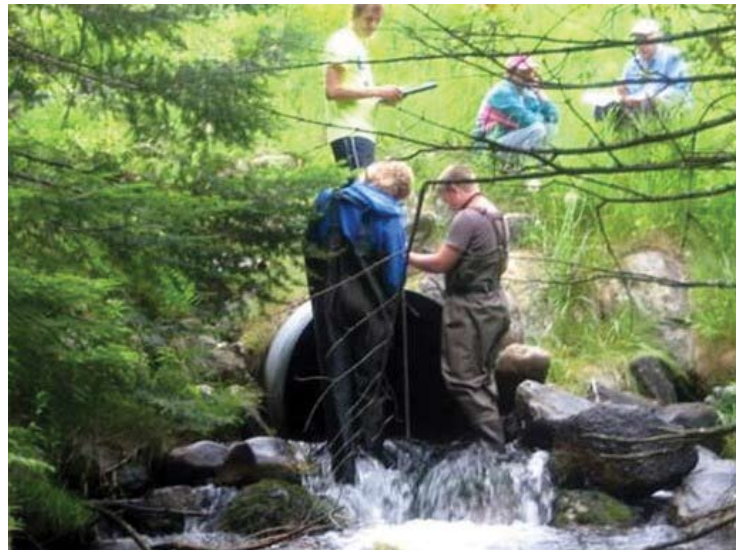
Perched culvert – barrier to fish passage

natural flow of this Grass River tributary, especially during major storm events. We envision stakeholders and partners in the core team to include people from Shanty Creek Resort, Pine Brook property owners, Antrim County Conservation District, Custer Township, Antrim County Drain Commission, and Grass River Natural Area.