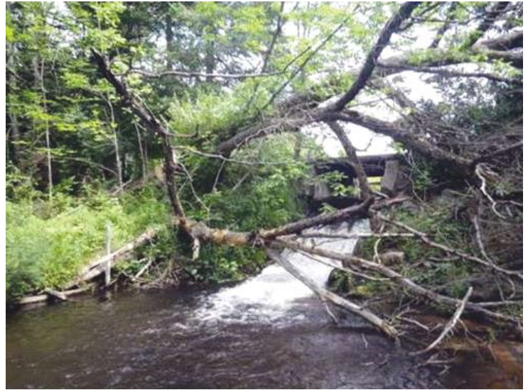
Overflow from dam on Shanty Creek – barrier to fish passage

There are two goals for this project in 2012. The first is to establish a core team of stakeholders and partners to develop and implement elements of a stormwater management plan for the Shanty Creek Watershed. This goal is grounded in the realization that Shanty Creek has experienced significant sand and sediment loading from bank erosion, fallen trees, and other barriers that interfere with the