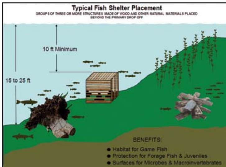
Typical fish shelters proposed for our lakes.