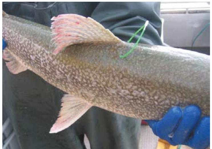
Relict lake trout with DNR tag

For additional information, fishermen may call (231) 547-2914.