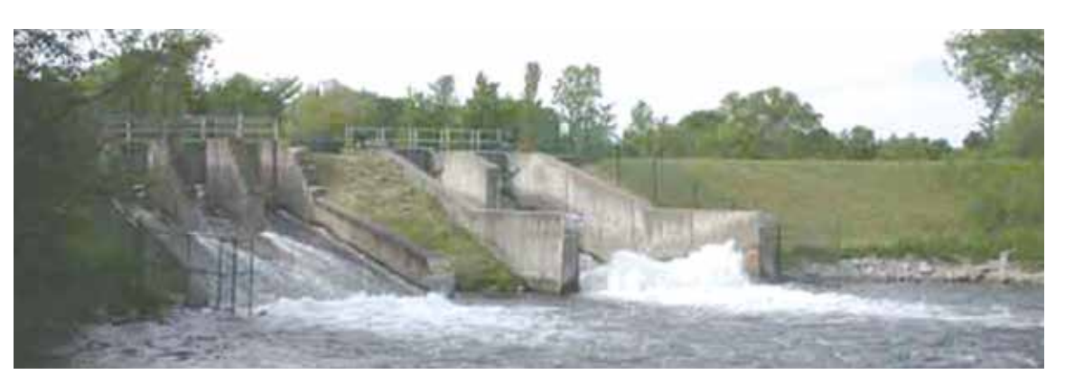
The Bellaire Dam - view from downstream

that I heard several times this spring: that the County was backing up water in Elk Lake to run the Hydro Dam for more profits—and therefore, causing Torch Lake to rise. In fact, the County is required by, and monitored by, several different government agencies to run the dam in "run of the river" mode, which means that we are only allowed to generate electricity from the natural flow of the river based on the legal lake level.