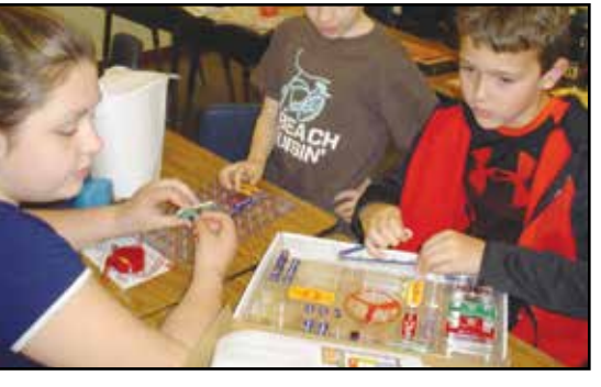
Students using the snap-circuits kits