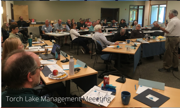
Torch Lake Management Meeting