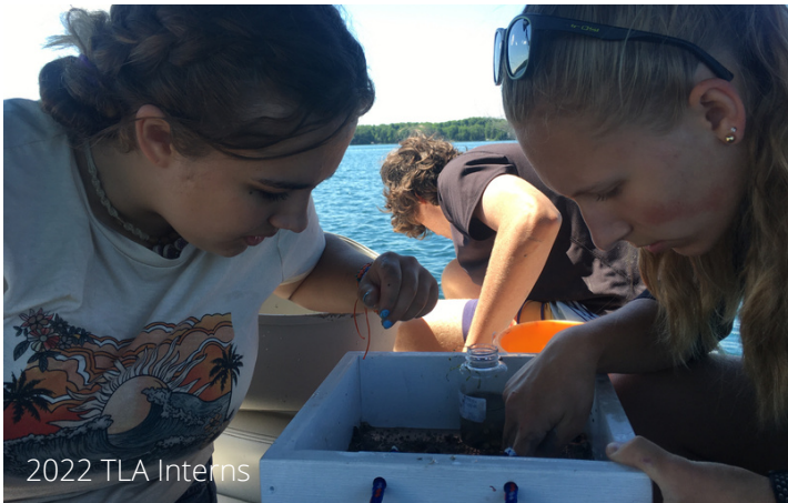
2022 TLA Interns